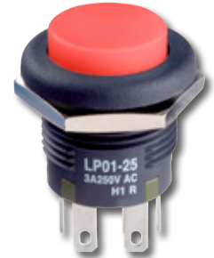
LP01 Series with Bright Red LEDs will Undergo Changes

The Bright Red LEDs for LP01 Series pushbutton switches will be changing. Both standard and custom pushbuttons are included in the revision. The change will effect electrical specifications, which are compared on the following table. Effected standard part numbers are shown below.