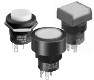
Changes for LP01, YB & YB2 Pushbuttons

I. The location of production will change for LP01, YB and YB2 Pushbuttons and YB Indicators from the Japan factory to the Philippines factory. The place of manufacture will no longer appear on the switches, and the NKK logo will be updated (with the exception of YB2 square switches). The lot number on the switch case will have a dot mark above the second digit, and the box in which the switches are packaged for shipping will read "PHILIPPINES FACTORY" instead of "JAPAN FACTORY." All of these revisions will apply to standard, custom and UL/CSA approved products. Effected standard part numbers are on the following pages.