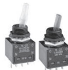
LED Specification Revisions for TL Series

The TL Series Illuminated Toggles will have changes to the LED specifications for Bright Red (code C) and Bright Amber (code D) LEDs. The changes will effect all of the switches, including both actuators lengths, and standard and custom devices. The specification revisions are outlined below, followed by effected standard part numbers.