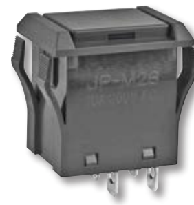
Changes for JP Series Pushbuttons

I. The location of production will change for JP Pushbuttons from the Japan factory to the China factory. The place of manufacture will no longer appear on the switches, and the NKK logo will be updated. The lot number on the switch case will have a dot mark above the first digit, and the box in which the switches are packaged for shipping will read "CHINA FACTORY" instead of "JAPAN FACTORY." All of these revisions will apply to standard, custom and UL/CSA approved products. Effected standard part numbers are on the following page.